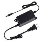
DC12V/2A Power Adapter